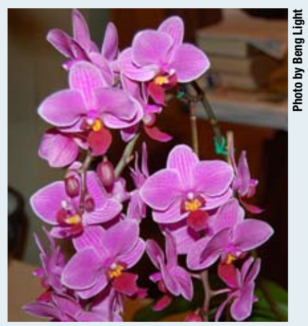
Phal. (Tropical Fantasy X equestris)