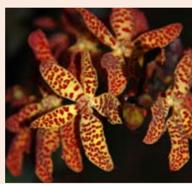
Wall of orchids above the lecture hall doorway