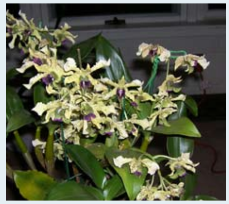
Den. atroviolaceum