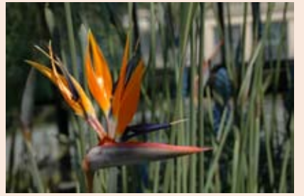
Not an orchid