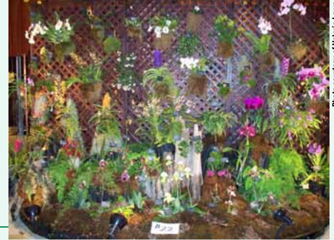
MOS exhibit before judging.