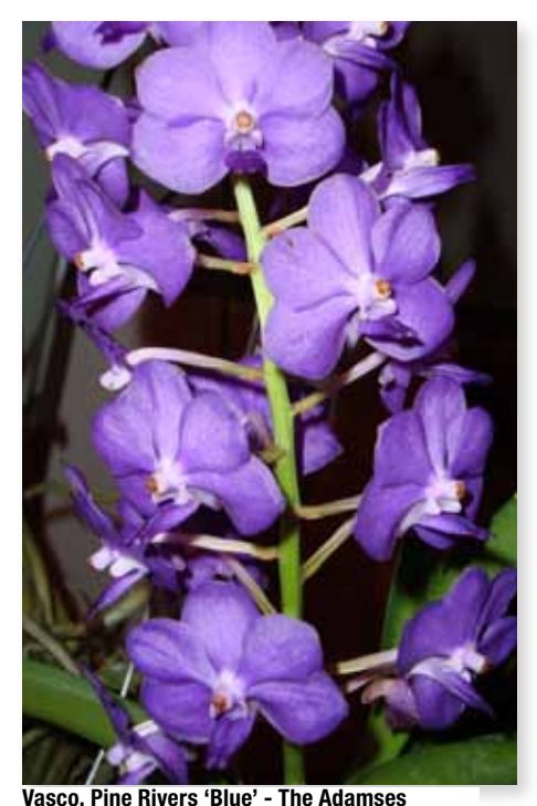
vasco. Fille nivers blue - The Adams