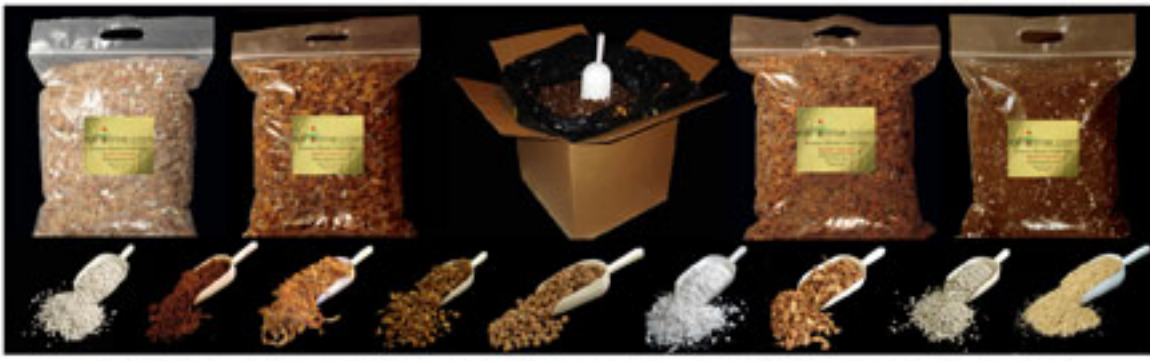
16 Classic Mixes & 9 Imperial Orchid Mixes "Make Your Own" Custom Mix - 50 Media Choices