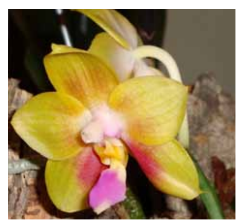
Phal. Joy Spring Canary 'Rainbow' - The Adamses

growing area. With paphiopedilums , especially, "cleanliness is next to godliness" and if the growing area is littered with old foliage, weeds and dying flowers, keeping the plants alive and flowering will be next to impossible.