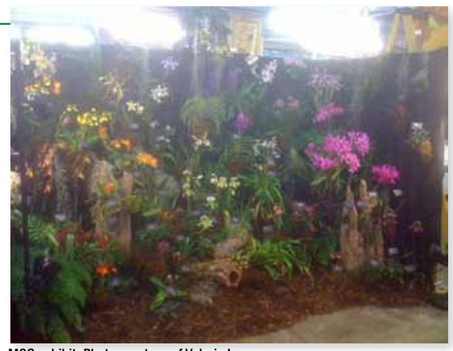
MOS exhibit.