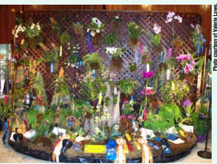
MOS exhibit after judging.