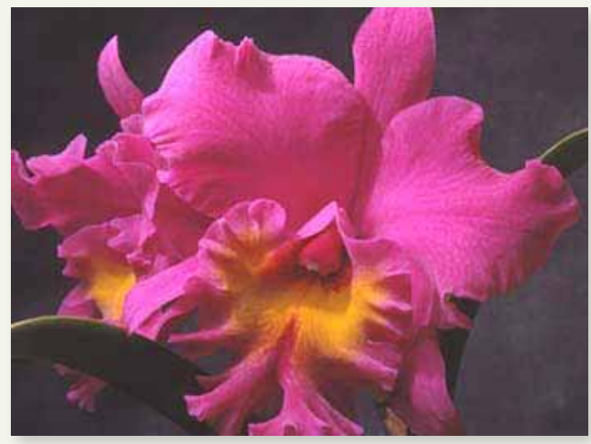
The former Blc . Bryce Canyon 'Splendiferous' AM/AOS is now properly Rhyncholaeliocattleya Bryce Canyon. Brassavola digbyana is correctly, Rhyncholaelia digbyana .

This fall, the newest nomenclature rules will be published by the International Society for Horticultural Science (ISHS). Contained in the new rules will be provisions for the registration of names below grex. Currently, the rules do not provide a clear, organized way to handle recognition of distinctly different strains in hybrid registration. Under the new rules it will be possible to assign a "group name"