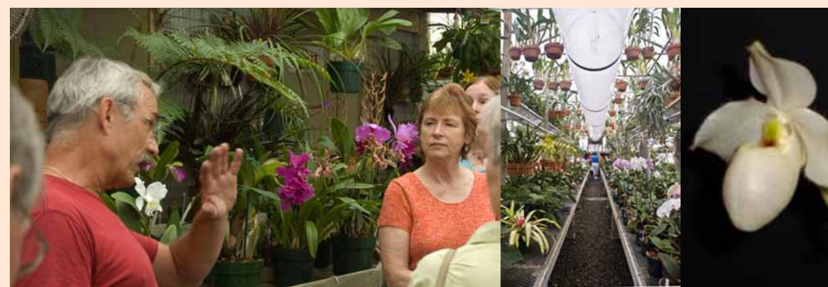
os from the 2009 open house by Clark Riley Paph. Deperle var. album ( primulinum 'Lemon Pie' x delenatii var album ) from TLG.