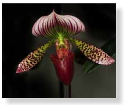
continued on next page