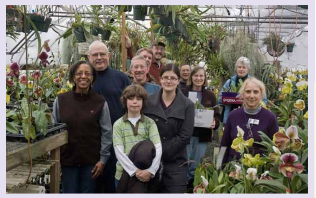
Pirouetting Through the Paphs MOS members and friends take a shopping break to pose amongst blooming beauties.

There were 46 MOS members at the January meeting.