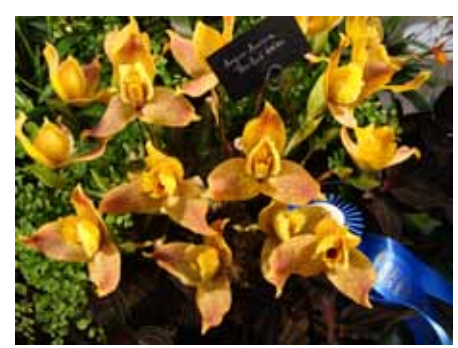
The Little Greenhouse's Angest. Aurora 'Harford' AM/AOS from the 2010 show.