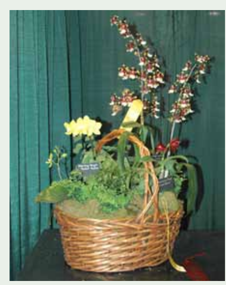
Patty Kelt's 2010 Exhibit