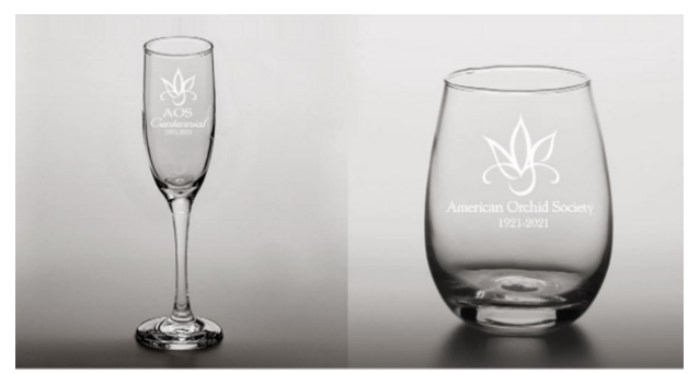
8oz screen printed champagne flute

Don't forget, we have our <u>Centennial Celebration</u> <u>commemorative glasses available for purchase on our website!</u>