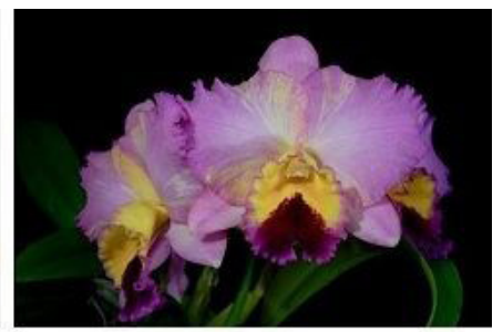
AD | AOS (0 points) Award #20196652