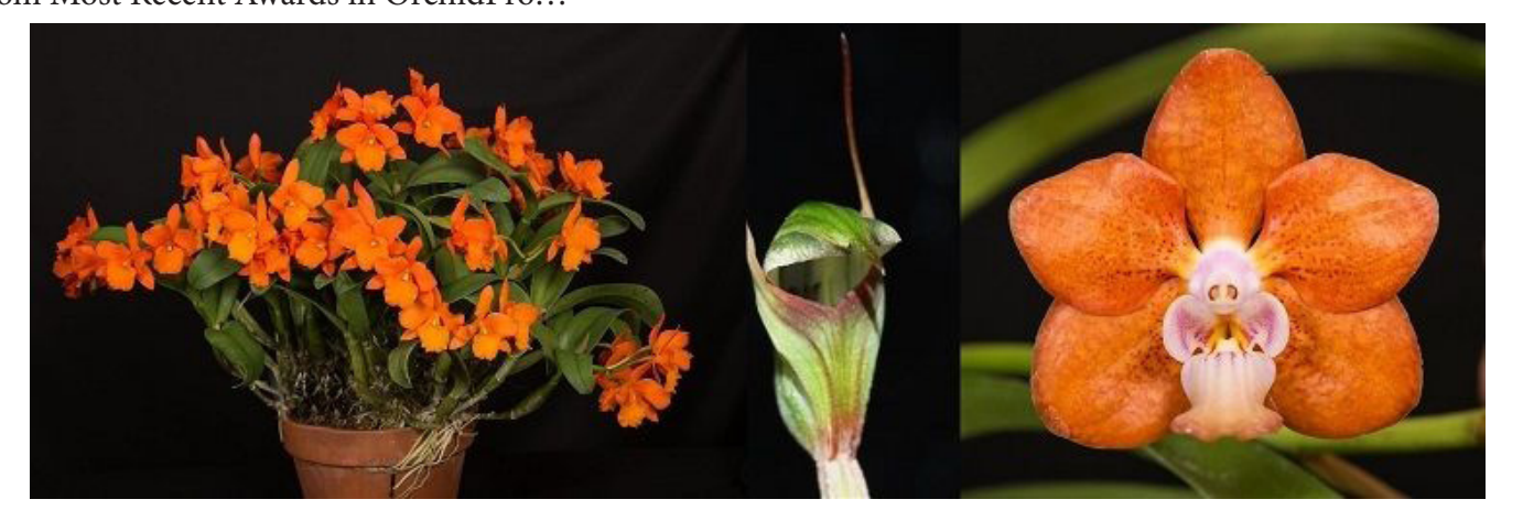
(Rhyncattleanthe Orange Nuggett x Cattlianthe Viola Sanjume)