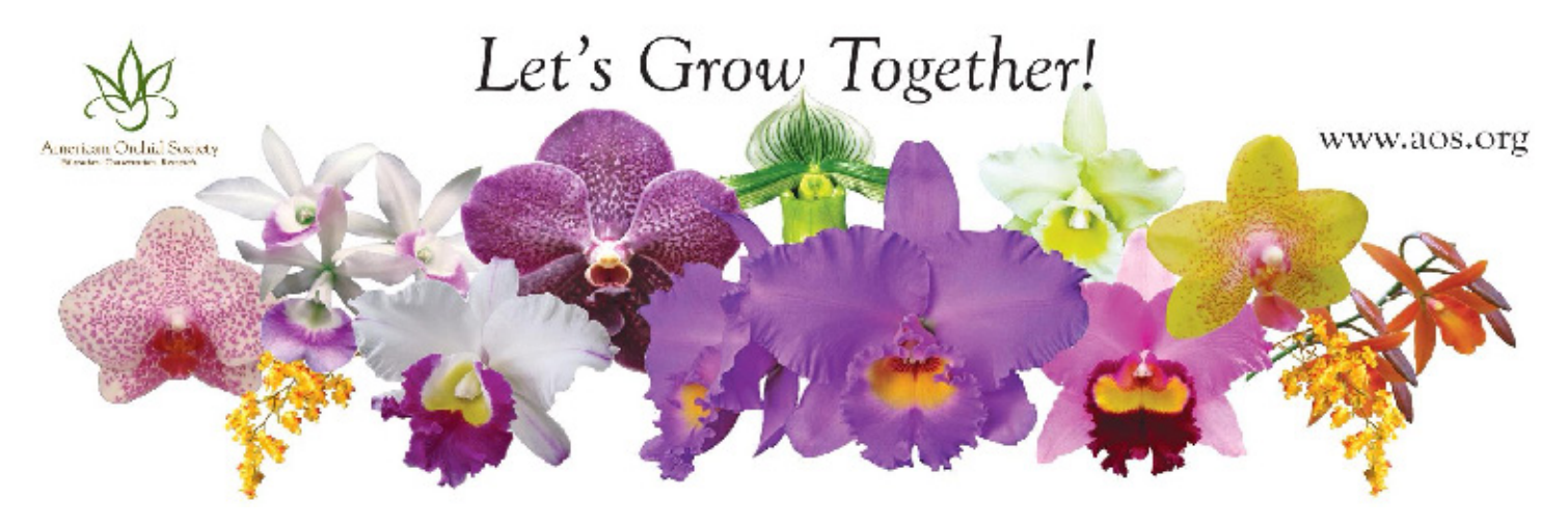
2021 APRIL AOS Corner – for Affiliated Societies

The AOS Corner is for society representatives and newsletter editors: Orchid societies are welcome to reproduce the AOS Corner completely, or in part, in their society publications. We encourage use of the AOS website by all members. <a href="http://www.aos.org">http://www.aos.org</a>