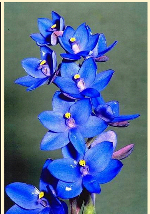
Thelymitra crinite. An Australian terrestrial