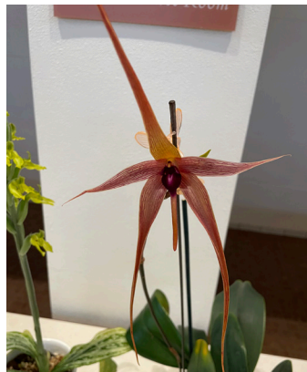
Bulb. echinolabium 'The Big Stink' - Mai Conaway