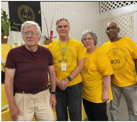
Judges: 2023 Maryland State Fair Orchid Exhibit