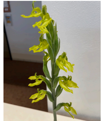
Sarc. Sceptrodes - Fay Citrone