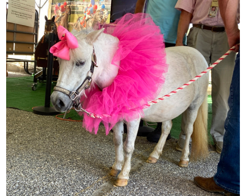
Bubbles: Crowned "Miss Maryland State Fair 2023"